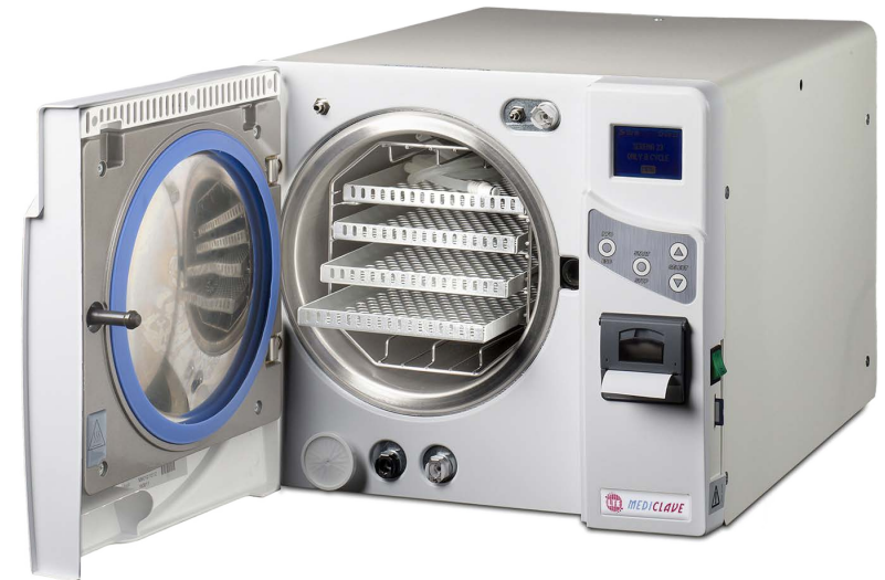
18 Litre Model with Printer

Vacuum pump - Fitted with vacuum pumps to aid the air removal and cooling. See table opposite to find out which load types suit each class of autoclave.